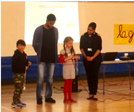
Giving out character badges at the Elementary School-wide Morning Meeting

Next month's themes will be perspective and citizenship. Students will learn about perspective by working to look at the world through other people's eyes and understanding differences. They will also explore citizenship and teamwork by learning to work well as a member of a group or team.