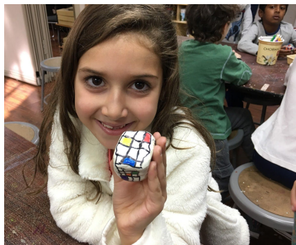
1st grade, Rubik's Cube & color wheel lesson

Mark your calendars and please join us for the upcoming December 5 PTO meeting. We'll be meeting at 7:00p.m. at HoLa's middle school location - the Rue Building on 301 Garden St. - to discuss upcoming school events, among other topics. Babysitting will be provided.